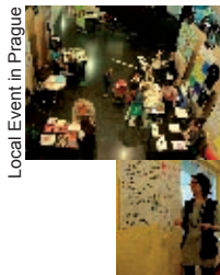
Local Event in Prague