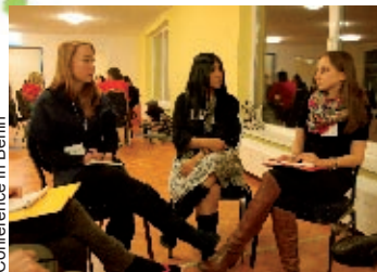
Conference in Berlin