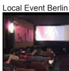
Local Event Berlin