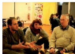
Conference in Berlin