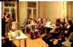
Local Event in Krakow