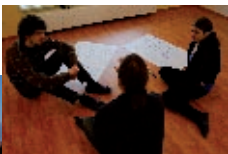
Conference in Berlin