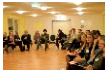
Conference in Berlin