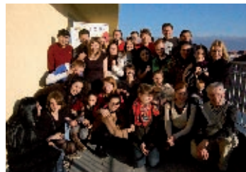
Conference in Berlin