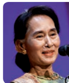
Aung San Suu Kyi Political Leader, Nobel Peace Prize Laureate, Burma