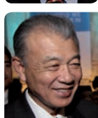
Yohei Sasakawa Chairman, The Nippon Foundation, Japan