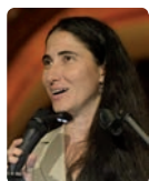
Yoani Sánchez Blogger, Activist, Cuba

Democratically elected Tibetan political leader based in Dharamsala, India. Mr. Sangay previously worked as a senior fellow at Harvard University and organized conferences between the Dalai Lama and Chinese scholars. He has lectured at various universities and think-tanks throughout Europe, Asia and North America as an expert on Tibet, international human rights law, democratic constitutionalism and conflict resolution. In 2007, he was selected as the one of the 24 Young Leaders of Asia by the Asia Society. Mr. Sangay was the first Tibetan to graduate from Harvard Law School in 2004.