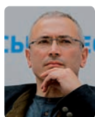
Mikhail Khodorkovsky Businessman, Former Prisoner of Conscience, Russia

Professor and Chair of Middle East and Mediterranean Studies at Sciences Po, Mr. Kepel is also the Founder and Chairman of the Eurogolfe Network, and was a Visiting Professor at New York University and Columbia University (1995–1996). He has published several books on the Middle East and Islamic Terrorism and contributes to the Financial Times, Le Monde, La Repubblica, El Pais, and a number of Arabic language and international newspapers. Mr. Kepel earned his Ph.D. from Sciences Po.