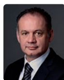
Andrej Kiska President, Slovakia