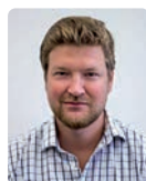
Lukáš Sedláček Executive Director, European Leadership & Academic Institute, Czech Republic

Former Minister of Foreign Affairs (2007–2009, 2010–2013) Former Deputy Prime Minister and Chairman of the TOP 09 party. He was a member of the Senate of the Czech Parliament (2004–2010). During the first half of 2009, he also served as the President of the Council of the European Union. He was President of the International Helsinki Committee for Human Rights (1984–1991) and former Chancellor to President Václav Havel. In 1991, he was awarded, together with Lech Walesa, the Council of Europe's Human Rights Award.