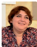
Khadija Ismayilova Journalist, Activist, Azerbaijan

Journalist, radio host and an investigative reporter with the Organized Crime and Corruption Reporting Project. Ms. Ismayilova is a host of the daily current affairs show on Radio Free Europe/Radio Liberty in Azerbaijan. Her investigations on the President Aliyev's family businesses received international awards and resulted in government attacks against her. She was named one of the Brave Thinkers of the world by Atlantic magazine – one of 21 people risking their reputations, fortunes, and lives in pursuit of big ideas. Since 1997 Ms. Ismayilova has reported for Azerbaijani, Russian and English newspapers of the region and has held management positions at Azerbaijani newspapers and RFE/RL. In 2012 she was awarded the Gerd Bucerius Free Press of Eastern Europe Award and the Courage of Journalism Award by U.S.-based International Women's Media Foundation.