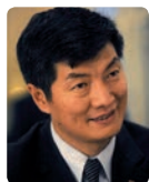
Lobsang Sangay Sikyong, Central Tibetan Administration, India/Tibet