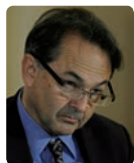
Gilles Kepel Political Scientist, Sciences Po, France