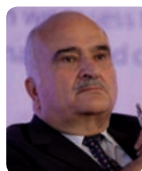
Prince El Hassan bin Talal Chairman, West Asia- North Africa Forum, Jordan