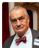
Karel Schwarzenberg Former Minister of Foreign Affairs, Czech Republic