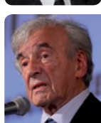
Elie Wiesel Nobel Peace Prize Laureate, USA