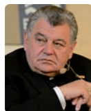
Dominik Duka Cardinal, Archbishop of Prague, Czech Republic