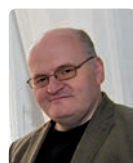
Daniel Herman Minister of Culture, Czech Republic