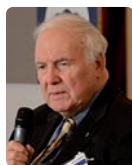
Michael Novak Theologian, Political Scientist, USA