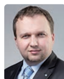
Marian Jurečka Minister of Agriculture, Czech Republic