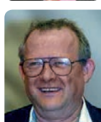
Adam Michnik Editor in Chief, Gazeta Wyborcza, Poland