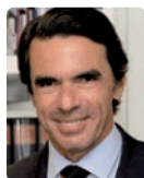
José María Aznar Former Prime Minister, Spain

graduated from the Hebrew University and the London School of Economics.