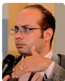
Ahmed Maher Blogger, Activist, Egypt