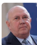
Frederik Willem de Klerk Former President, Nobel Peace Prize Laureate, Republic of South Africa