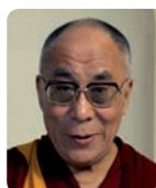
His Holiness the Dalai Lama Spiritual Leader, Nobel Peace Prize Laureate, India/Tibet